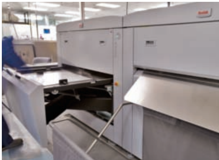
King Printing Co., Inc. is a value-added services provider that operates a KODAK MAGNUS 800 Platesetter and other new technologies that increase efficiency. KODAK Unified Workflow Solutions enable King Printing to operate streamlined digital and traditional print environments.

King Printing has achieved what many graphic communications firms aim to accomplish—becoming a value-added services provider. A